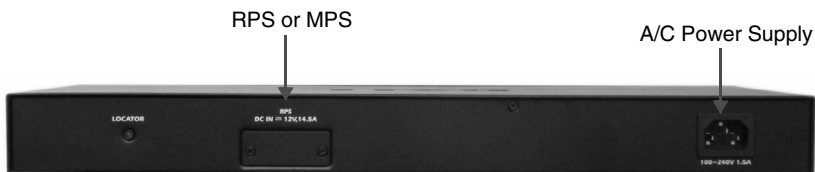
Figure 1-2. Back-Panel Power Connector

The power connectors are positioned on the back panel. Connecting a Redundant Power Supply (RPS) or Modular Power Supply (MPS) is optional, but recommended. The RPS or MPS connector is on the back panel of the switch. The RPS is used for non-PoE switches and MPS is used for PoE switches.